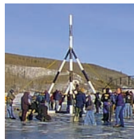
Fig. 1. Townspeople of Nenana, Alaska, raise the tripod on the frozen Tenana River, 4 March 2001.

nana and Fairbanks, Alaska (90 km away). Climatic data for January to April (the months preceding ice breakup) of each year obtained from the Western Regional Climate Center (5) included daily precipitation (PCPN), snowfall (SNFL), and air temperature minima (TMIN) and maxima (TMAX). Years in which any month had fewer than 15 days of data were removed from analysis, leaving 32 to 35 years of data for the Nenana records and 47 to 51 years for the Fairbanks records. Heat-island effects due to urbanization and movement of the weather station may affect the Fairbanks record. By con-